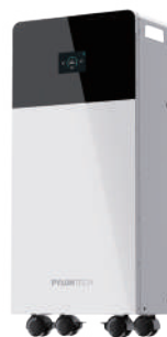
Fidus Battery Plus